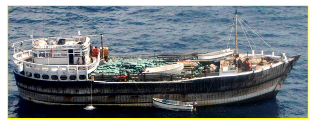
A typical mother ship

The PAGs do not need to be able to operate the mother ships they pirate; they use the vessel's crew to do that often treating them with extreme violence and keeping them in harsh conditions. Under the current rules of engagement governing action by the military, life cannot be put at risk. As a result, the pirates who are now no more than organised criminal gangs, have learned the value of using captive crews as hostages. If a Naval warship draws close, the pirates simply point a gun at the head of a hostage and threaten to pull the trigger if the naval ship does not pull away. The naval forces have no choice but to comply.